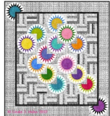
This is the "with border" version/multi color spires and pie shapes.

I will have a limited number of Pigma brush pens and 9-1/2" rulers in class for optional purchase—as well as additional packs of foundation paper, miniature kits and books at a great bundle price.