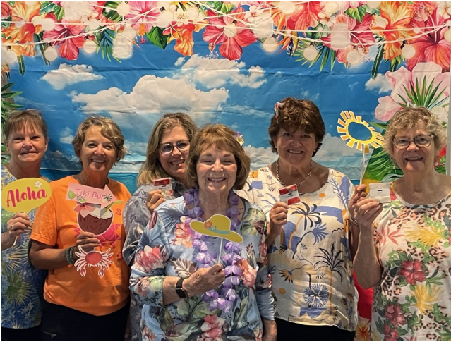
Scavenger Hunt Winners